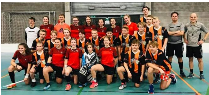
Tigers U16 & female Team Belgium U19