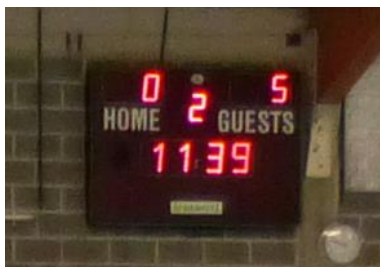
Scoreboard: a wake-up call

After a win in our first match in September, the second match in October was against our dear neighbours Waterloo Lions. They have always been a tough opponent to us, a strong and skilled team with several talented players. Maybe that was one of the reasons that disturbed our concentration on the essential, letting them to a 0 - 4 lead already in the 1st period. After them scoring 0 - 5 in the beginning of the 2nd, it was time for the Tigers to wake up. There was a clear change in the already sunken spirit, and the rest of the 2nd period brought us to 2 - 5. The 3rd period continued showing the floorball that we are used to see from our team, but ending with a 3 - 5 score for the Lions.