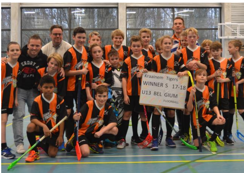
The proud team after an exciting final game