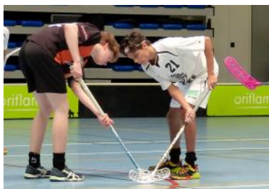
Tigers-Lions: action guaranteed

Having won the Belgian championship title for two previous years in a row (one U16, one U19), the outset for our U19 team was very clear: To claim the 3rd one. To achieve that result in a season with only eight matches you have to start and continue in a determined way, and keep a disciplined way of playing and winning from the very beginning. A will to win is important, and with this team you could really feel it as from the start of the season.