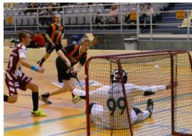
2-4: the victory is ours

the team by scoring 1 - 3, assisted by Sven. Unfortunately, the certainty of a two-goal lead didn't last for long, since Stimulo scored again a 2 - 3 power play goal four minutes before the end. Keeping in mind that a tie would not have been enough for us, this created a bit of a pressure on the Tigers.