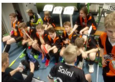
A difficult start of the season

pletely a true image of how the game went. At times, we were able to keep up with the superior Fireballs. We followed up with a rather unfortunate draw against Atom Eagles, with our Tigers holding onto a 2:1 lead with less than 2 minutes to go in the game. Well, they scored the equalizer in the end and, all things considered, the draw was a fair result.