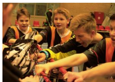
Let's go for it—together!